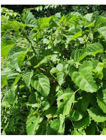
Urera Baccifera, Costa Rica