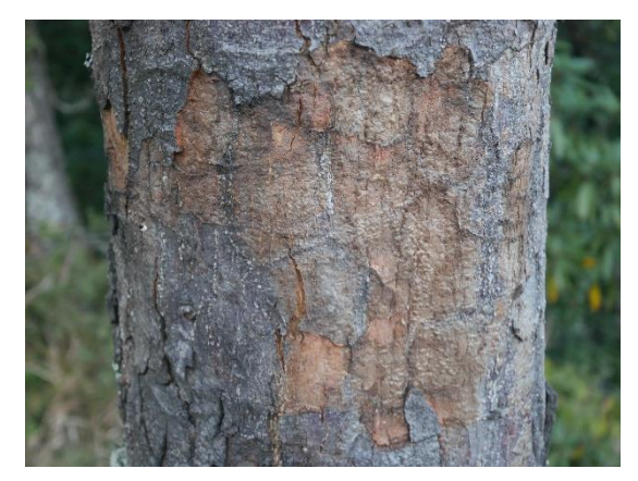
Quercus dilatata, India

Many people with an interest in experimenting, or those who are experimenting, have already identified locally important tree species as potential alternatives to the Quercus species. For example, in some areas of Latin America, it is believed that Capororoca ( Rapanea ferruginea ) could be a replacement for Oak, and in Africa, they have identified the Meru Oak, ( Vitex keniensis ) as potential substitutes for Quercus robur . In Asia, alternative species have been identified in Vietnam and the Philippines. Preliminary studies of calcium contents of Moringa oleifera and Terminalia arjuna have already been done in Asia, demonstrating much similarity with Oak bark. A deeper understanding of the cosmic qualities of those trees still remains to be investigated.