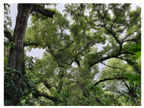
Quercus insignis, Guatemala