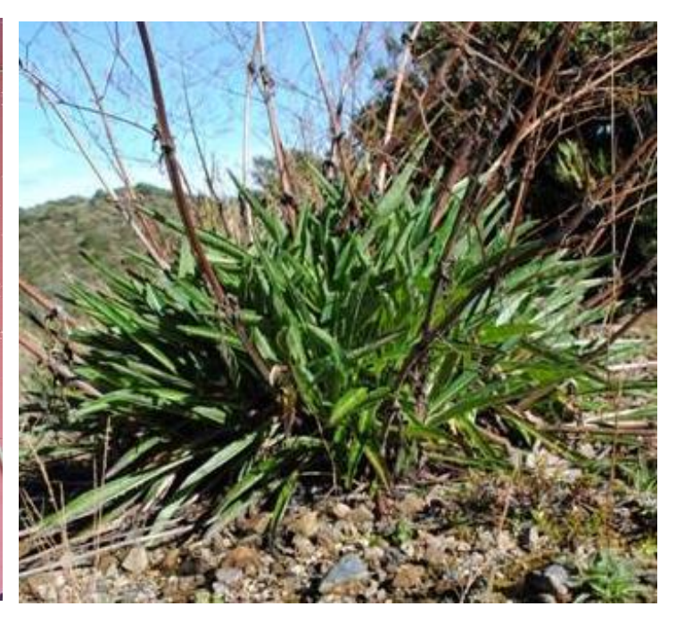
Valeriana edulis, Mexico